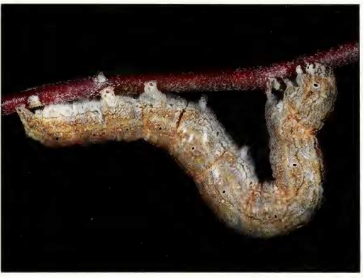
Fig. 9. Fully grown (some days prior to pupation) last Fig. 10. Fully grown last instar larva of Rhynchina canariensis (lateral view).